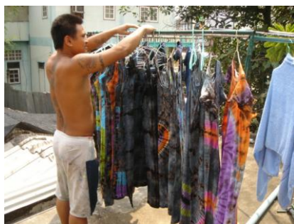
Fig. 4. Clothes on the sun to dry.

Two groups of health problems directly caused by conventional treatment processes, which requires the tangible substance to separate chlorine tank to precipitate and discarded or until the chemical or powder scoop sediment from the bottom of the tank, which poses a danger to those exposed, if not protected well enough.