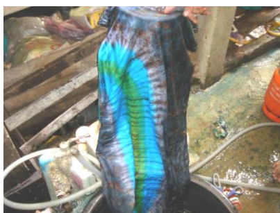
Fig. 3. The process of washing with water.

The first chemical residues in water due to the production process that uses chemical dyes to dye fabric, of course, reject water cannot be treated with residue into a public course. The purpose of this research is to solve problems for the operators of sewage dumped into the stream from the production process before the public. The hot-air wastewater treatment and installed permanently (refer with: Fig. 3 and Fig. 4).