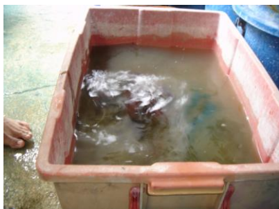
Fig. 2. Chlorine dip after dipping paint for 1- 3 minutes.

The first chemical residues in water due to the production process that uses chemical dyes to dye fabric, of course, reject water cannot be treated with residue into a public course. The purpose of this research is to solve problems for the operators of sewage dumped into the stream from the production process before the public. The hot-air wastewater treatment and installed permanently (refer with: Fig. 3 and Fig. 4).