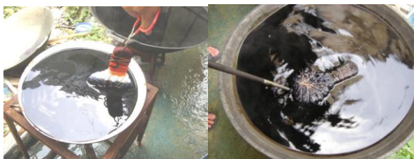
Fig. 1. The process of dipping and black colors, the color of the product.

surrounding community that happens to occur as follows. (refer with: Fig. 1 and Fig. 2).