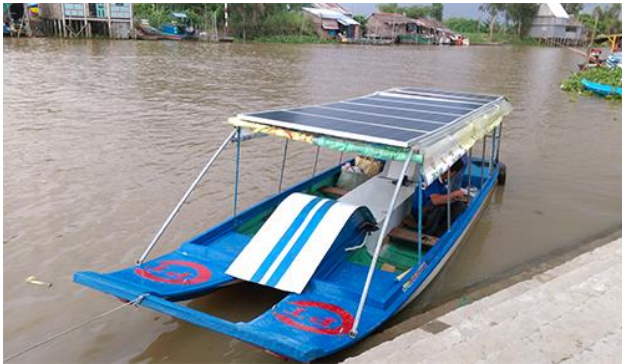
Fig. 4. Solar powered boat in Dong Thap province.

Currently, in Dong Thap province, Vietnam also has a model of solar powered boats for tourism. The boat operates on the principle of storing energy from sunlight through the battery and then charging it to the battery, which helps to run for 30 km continuously for 3 hours at a speed of 8-12 km/hour. Large cities such as Hanoi and Ho Chi Minh, with high population densities or congestion, should use this technique to improve the environment and minimize traffic flow (Fig. 4).