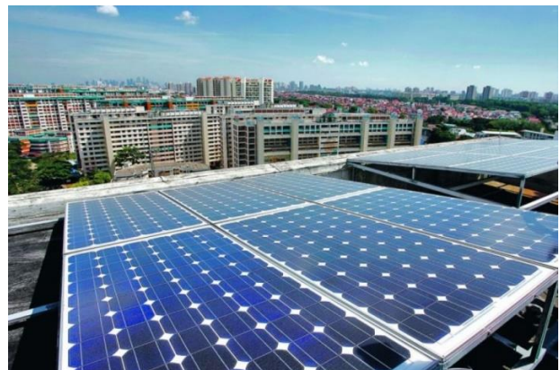
Fig. 3. PV and solar heating panels.

Solar hot water system is also a popular solution but not everyone knows, especially in remote areas in Vietnam that have not been exploited effectively. A solar water heater in Vietnam includes a collection of heat collectors, hot water storage tanks, auxiliary tanks, cold water supply tanks, brackets, etc. The collection tube has a transparent glass cover in on top and a layer of insulation below (Fig. 3).