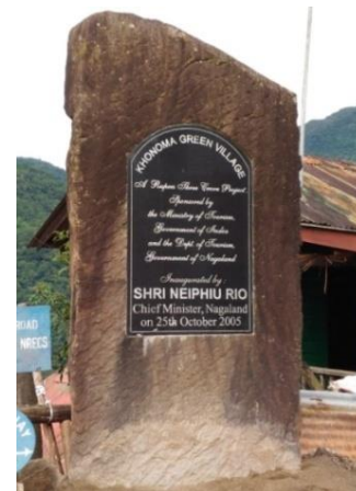
Fig. 2. Green-village monolith.

Manuscript received July 12, 2019; revised November 12, 2019.