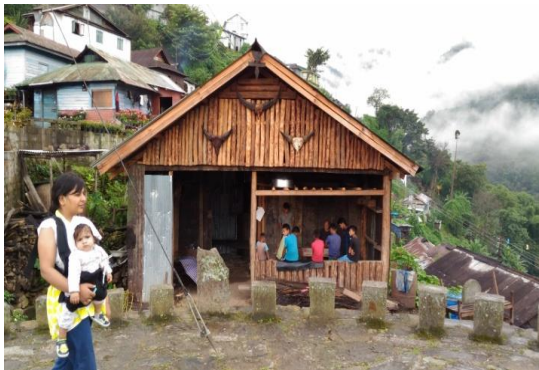
Fig. 4. Wooden house.

The As a part of tradition each house develops a small garden in front of their house. In which they plans the beautiful and vivid colour flower plants, daily use vegetables and medicinal plants, which make the households self sufficient.