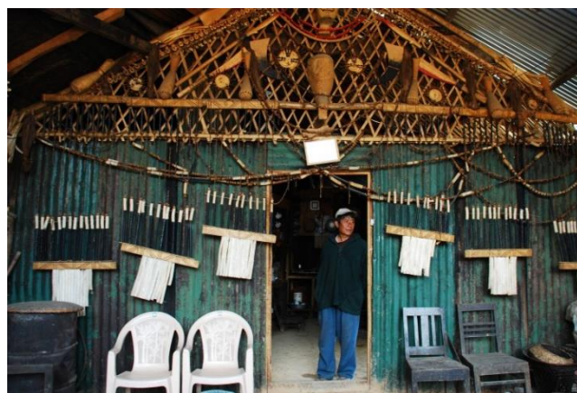
Fig. 3. Morung.

Each person of Khonoma, let it be either boy or girl, young or old are the member of one or other bodies of Khonoma such as; village council, Village Development Board, student union, Khonoma Women’s Organisation etc. In addition, all villagers are part of an ‘age group’, such groups are formed by boys and girls in the age group 12-15 (born within specified dates), who carry out social activities like construction of rest-houses, village paths, and the formation of singing and dancing groups. Each age group is assigned a guardian, who is considered a spiritual parent. The ‘Morung’, popularly known as centre of learning and also the house of decision making, as an important centre of the village [9]. A typical morung is shown in Fig. 3 [10]. Khonoma has high literacy rate of approx 70%, There is good educational infrastructure consisting of six schools in the village [11]. Khonomaians celebrates 1st September is as the village’s ‘birthday’, to celebrate, they come from far and wide.