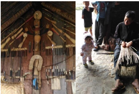
Fig. 5. Interior of house typical house & basket making.