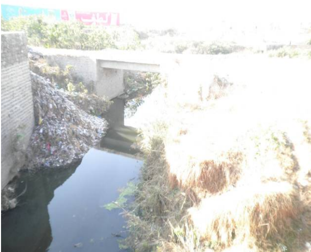
Fig. 7. Blockage of open drains due to solid waste dumps