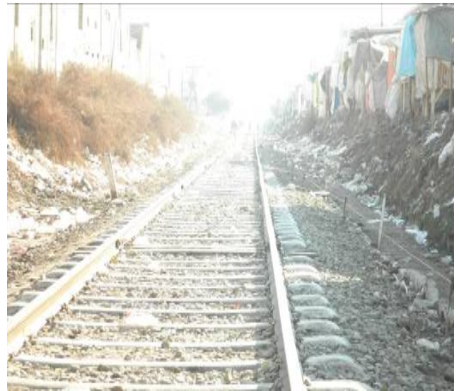
Fig. 4. Open dumps of MSW along the Railway track