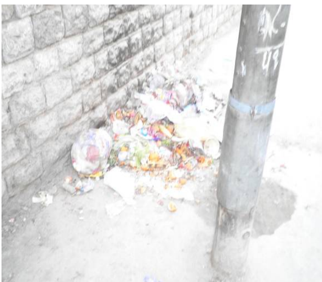
Fig. 2. Open dumps of MSW on streets