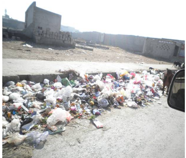
Fig. 3. Open dumps of MSW along road sides

Serious negative environmental impacts due to faulty handling of municipal solid waste can be observed in the Taxila city. Open dumping of municipal solid waste is a common practice in the study area. Main streets, roads, railway tracks, open drains and undeveloped plots in the study area have been seriously contaminated as shown in following figures from 2 to 6. Many negative impacts due to faulty handling of solid waste can be seen in Taxia city as shown in the following figures. These impacts are explained in Table 1 in detail.