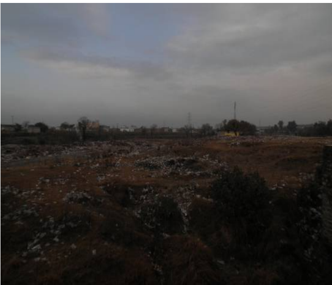
Fig. 11. Open dumps at disposal site under rain