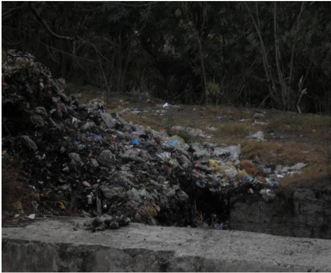
Fig. 6. Dumping of solid waste in drains