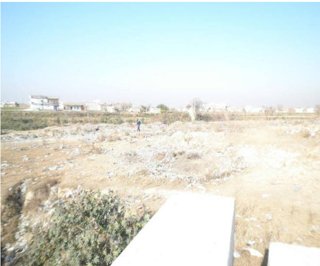
Fig. 10. Open dumps at final disposal site