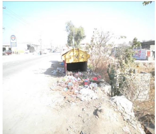
Fig. 8. Faulty Design of storage container in study area

In Taxila city, solid waste is being collected manually by the help of sweepers [5]. They are normally using wheel borrows, hand carts and motorcycle rickshaws for the collection of solid waste from the streets. At most of the collection locations solid waste containers are not available and dwellers are dumping the solid waste on ground. The generated solid waste from these locations is being collected by the help of open body vehicles irregularly. The selected disposal site for the city is not suitable and producing negative environmental impacts on surrounding populations. Storage containers are not compatible with the existing system as shown in the figures 8 & 9. It is also observed during the investigation that number of containers and collection vehicles are not sufficient to handle the generated waste. Considering the field analysis, the medium size containers with maximum 4.5 ft height may be more suitable under local conditions. The collection efficiency may be increased by the implementation of medium size containers, because at present large size containers are creating a lot of difficulties while handling of MSW in the town.