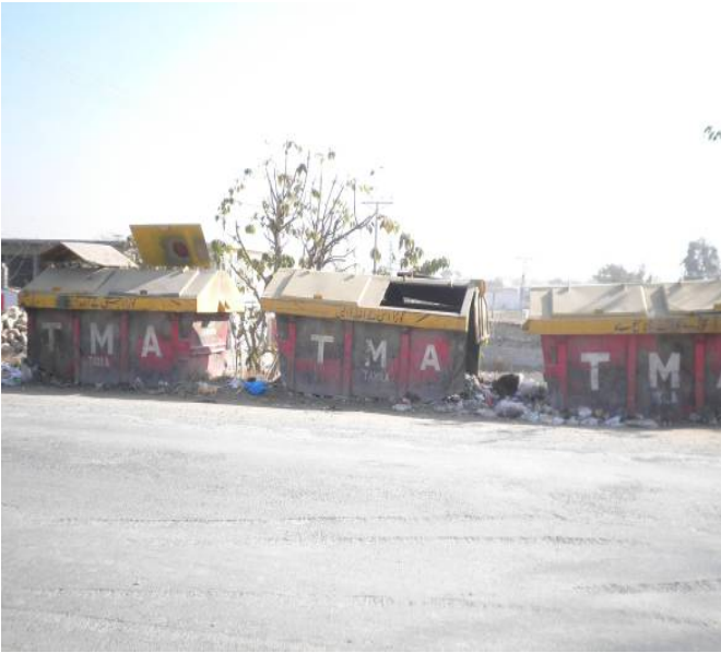
Fig. 9. More storage containers at same location