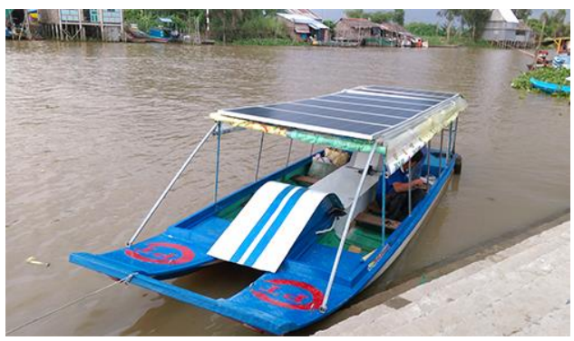
Fig. 4. Solar powered boat in Dong Thap province.

Currently, in Dong Thap province, Vietnam also has a model of solar powered boats for tourism. The boat operates on the principle of storing energy from sunlight through the battery and then charging it to the battery, which helps to run for 30 km continuously for 3 hours at a speed of 8-12 km / hour. Large cities such as Hanoi and Ho Chi Minh, with high population densities or congestion, should use this technique to improve the environment and minimize traffic flow (Fig. 4).