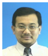
wastes as a source of fuel in ICE.