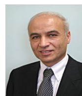
Laser diagnostic techniques and Compact heat exchangers.