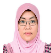
Biomass Utilization / Biofuel Production Research.